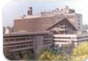
NSHM, Durgapur, Kolkata & Gurgaon