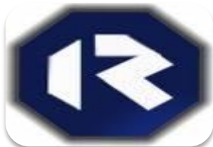
Rungta Education Group, Bhilai