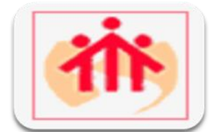
Don Bosco Group