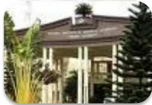
KIIT Deemed University, Bhubaneswar