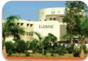
IBAT, Bhubaneswar, Bangalore & Pune