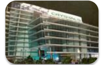
Globsyn Business School, Kolkata