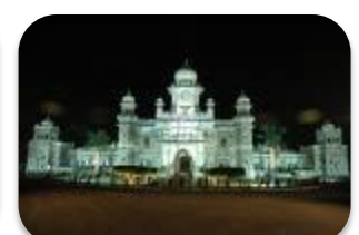
Daly College, Indore