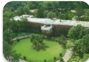
Doon School, Dehradun