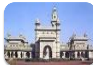
Mayo College, Ajmer